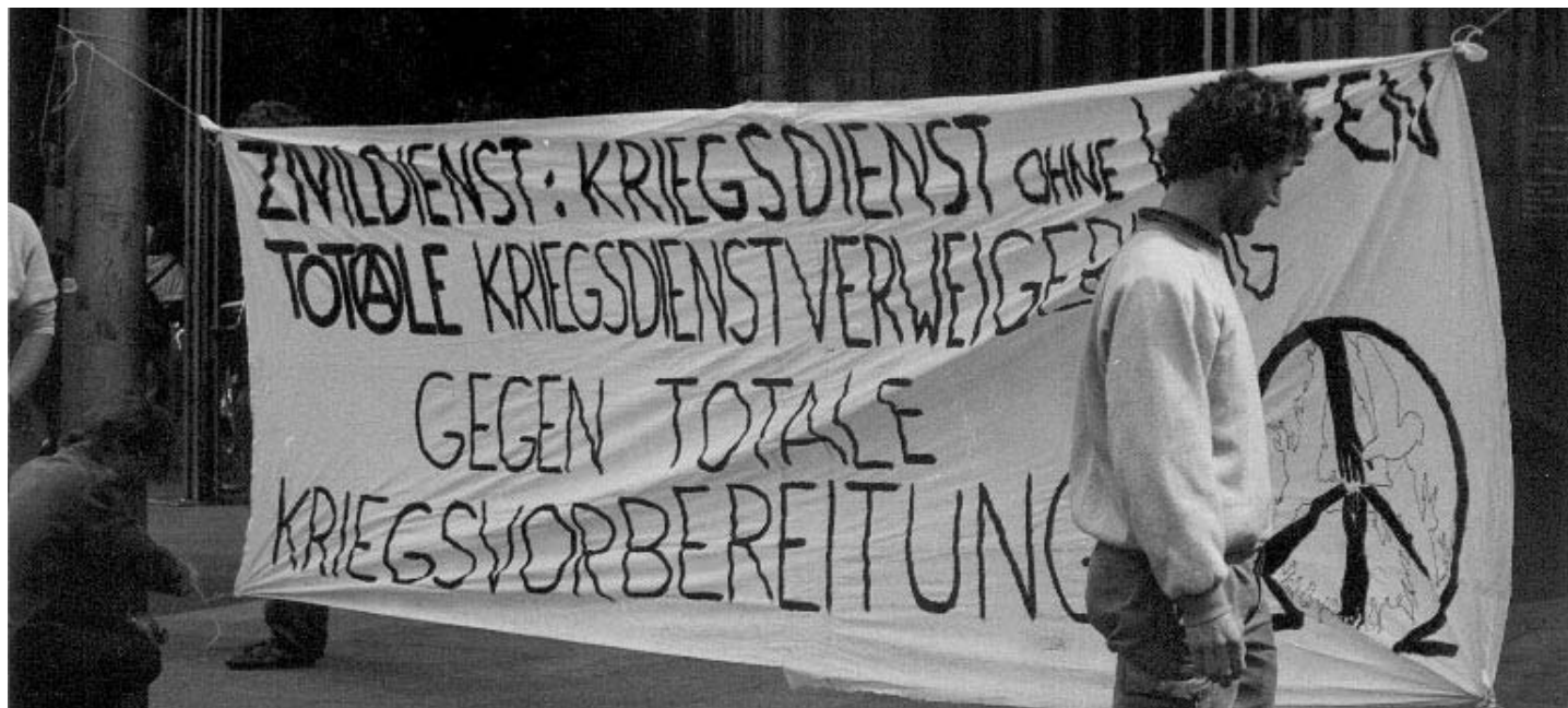
Total objection against total war preparations