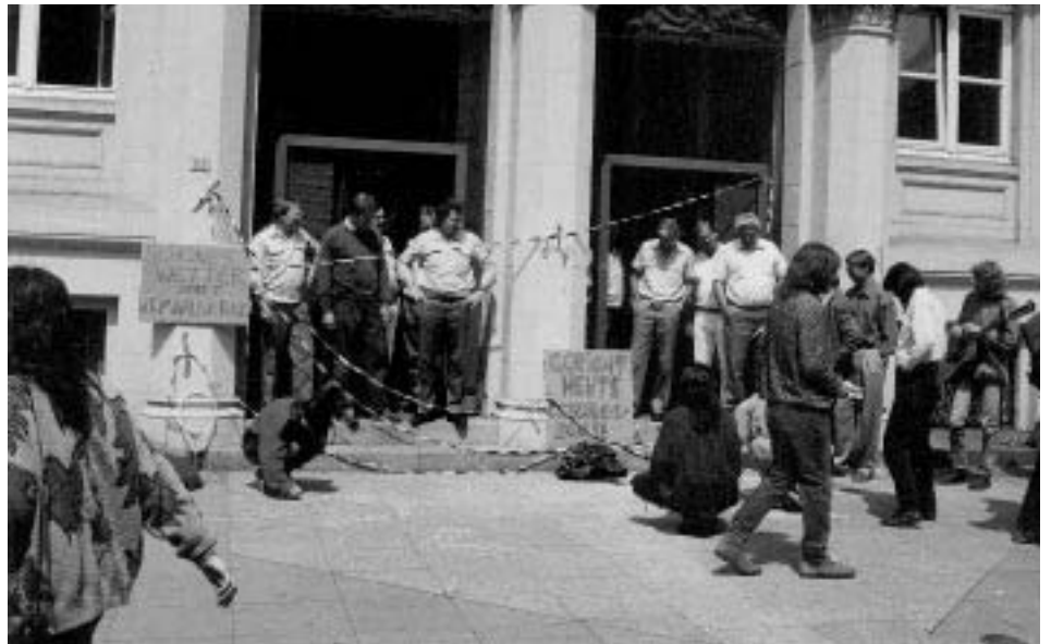
Solidarity action for total objectors. CO activists close a court in protest against criminalisation of total objectors. The banners read: "good weather instead of criminalisation" and "court closed today"

War Resisters' International 5 Caledonian Road London N1 9DX, Britain email: info@wri-irg.org