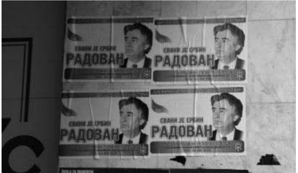
Belgrade is full with posters declaring "We are all Karadzic", protesting against extraditing the former Bosnian-Serb leader to The Hague.

opinions, as stated in his suicide letter, is an obvious example of how cheap life is in Serbia. If he didn't appreciate his own life, we can only imagine how valuable were lives of others to him, lives of police officers he commanded, or lives of the people he fought against in Kosovo and elsewhere, regardless of whether they were in uniforms or not.